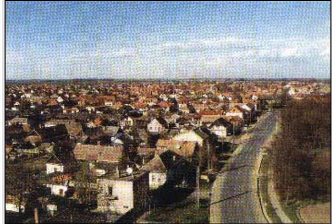
Panoramic view of village