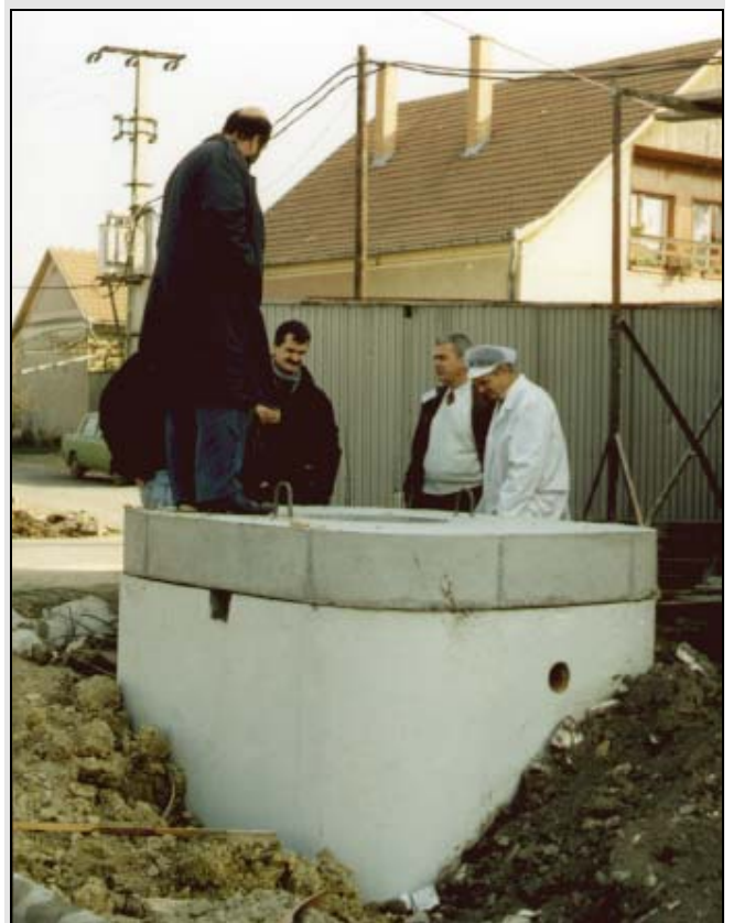
Pre-cast Concrete Collection Pit

Cost effective solutions to many difficult drainage problems